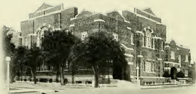
WHITTIER FRIENDS CHURCH